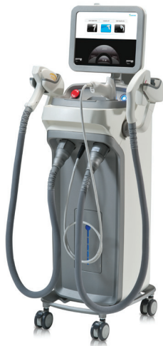
eIos Plus® - Complete aesthetic work station

Partner 360 is part of Syneron Candela's commitment to providing easy access to the marketing tools you need to grow your practice. This user-friendly customer portal and eStore enables you to quickly and easily download customizable practice marketing materials and a wide range of marketing resources 24 hours a day, 7 days a week.