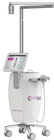
UltraShape Power - Body shaping via fat cell destruction

Intuitive user interface with easy-to-use guided treatment modes.