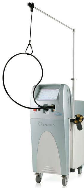
Alex TriVantage® - Pigmented lesion & tattoo removal treatments

Expanding aesthetic applications - reduces bruising associated with injectables and other cosmetic procedures.