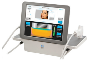
eTwo® - Complete facial rejuvenation

Partner 360 is part of Syneron Candela's commitment to providing easy access to the marketing tools you need to grow your practice. This user-friendly customer portal and eStore enables you to quickly and easily download customizable practice marketing materials and a wide range of marketing resources 24 hours a day, 7 days a week.