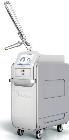
PicoWay® - The Complete PicoSecond Platform

Aesthetic solutions for both the face and body