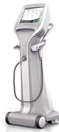
Profound® - 1 st device to create all 3 skin fundamentals

The perfect complement to any aesthetic practice.