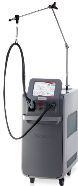
Gentle Pro Series™ - Integrated aesthetic treatment workstation

Shortest picosecond pulses – 40% shorter picosecond pulses mean effective, yet lower energies for less risk of side effects.