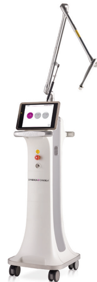
CO 2 RE® - The Complete CO 2 Solution

20, 22 & 24 mm treatment spots are the largest in the market, enabling shorter treatment times and improved patient comfort.