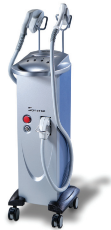
eLight™ — Safe and effective light-based elōs platform

Motif IR® - a safer, more efficient way of treating superficial skin texture and pore size for overall facial rejuvenation with zero downtime.