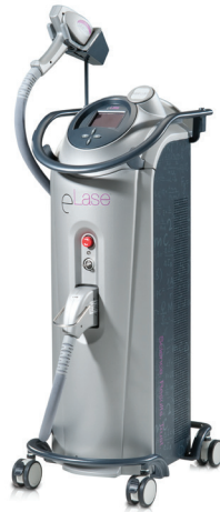
eLase® - Fast, pain free, effective hair removal

Quick treatments - typically 20 to 40 minutes depending on area treated.