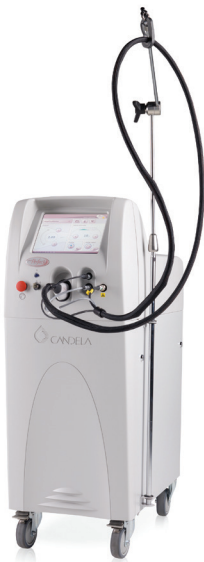
Vbeam® - Best-in-class pulsed dye laser

The gold standard in vascular treatments.