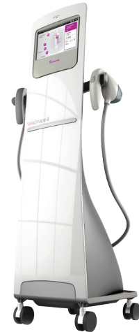
VelaShape III with Guided Mode - The art of body contouring

Mechanical effect, not thermal, for complete patient comfort with no bruising, swelling or downtime.